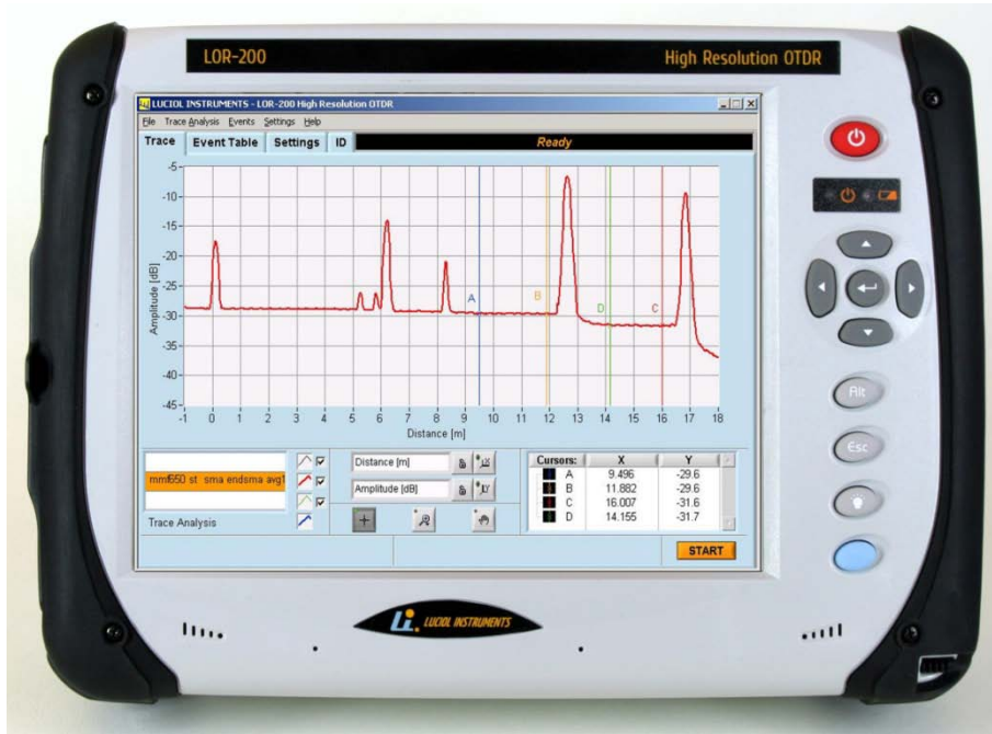
Figure 1: The LOR-220, High Resolution OTDR

This portable instrument can detect all types of events and faults in a fiber assembly thus enabling a fast and precise characterization of the optical link.